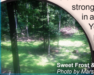
Sweet Frost & Dead Zone Mix

IT'S ALL ABOUT THE FRESHEST SEED! The mixture of blends put together here at HB Seed Co. are specially selected to aid in the following: • Assists in antler growth • Provides a good source of nutrition and protein for bucks, does and fawns • Gives a good food source and shelter for all birds • Aids in patterning all wildlife Remember to make sure you put the proper lime and fertilizer to help guarantee a healthy strong plant • If you are going to put in a food plot, as a rule of thumb! You get out of it what you put into it!