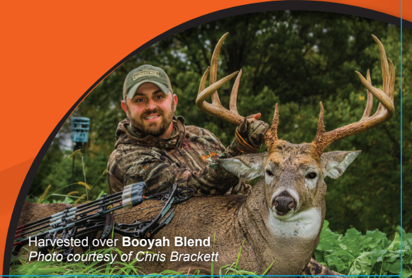
Harvested over Booyah Blend